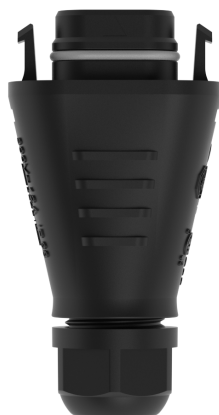
Flex-S3 Field Connector

The Flex-S3 Field Connector is used when a PV system has only one microinverter. It helps make a quick and simple connection between the microinverter and the electrical grid.